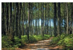
Forest (15 min)