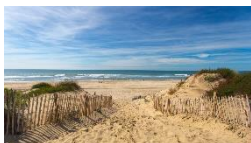
Océan (30 min)