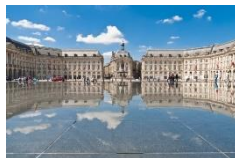
Enjoy Paris (4 hours by train) or Bordeaux (1h30)